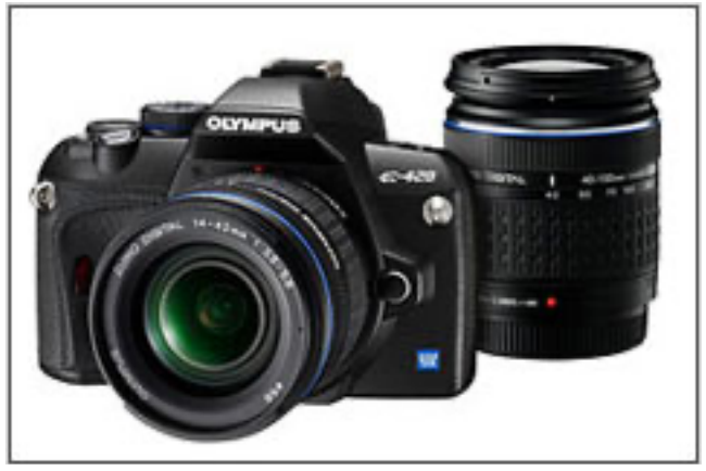
The Four Thirds system promises slightly more compact camera bodies and lenses. Four thirds is also the only DSLR system that uses the slightly squarer '4:3' format (as used on virtually all compact digital cameras).

Four Thirds is a new 'all digital' format developed by Olympus and currently used in Olympus and Panasonic DSLR models. Unlike the other systems on the market Four Thirds is not based on any existing film SLR system and uses a totally new lens mount, so all the lenses in the system are designed for digital, making the crop factor issues mentioned above less relevant. With the smallest sensor size Four Thirds offers slightly more compact camera bodies and lenses. Although the smaller sensor should in theory mean that these cameras produce noisier (grainier) results in low light and at higher sensitivities, for most purposes the difference isn't huge.