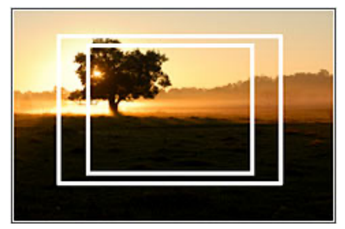
The three most common sensor sizes compared: full frame, APS-C and Four-thirds. Smaller sensors 'crop' the scene and make a lens appear to have a longer focal length.

For telephoto shooters the result is quite a bonus, as all your lenses will effectively get even more powerful. On the other hand the crop factor means your wide-angle lenses will no longer offer anything like a 'wide' field of view. Fortunately there is a wide range of specially designed 'digital only' lenses for smaller sensor DSLRs.