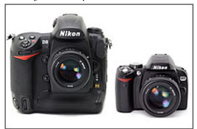
The difference in size and weight between a full frame professional level camera (Nikon D3, left) and a compact entry-level DSLR (Nikon D60, right) is considerable.

APS-C is by far the most common format, used in virtually all Canon, Nikon, Pentax and Sony DLSR models. With a crop factor of 1.5x or 1.6x you need special digital lenses to get true wide-angle results, but these are readily available and are usually less expensive than their 'full frame' counterparts. The 'kit lens' supplied with most APS-C cameras is a good starting point, offering a versatile zoom range from wide-angle to short telephoto.