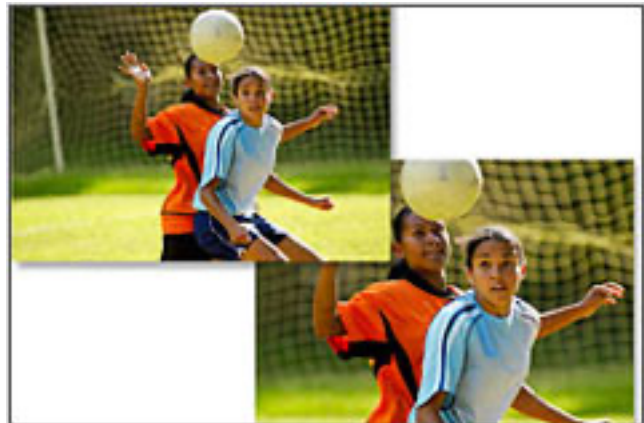
For sports and wildlife shooters the smaller sensor has the effect of making their telephoto lenses and zooms even more powerful.

So which is right for you? Each has its own benefits and each has its limitations, and if you're building a DSLR system from scratch you needn't get too hung up on which is right for you.